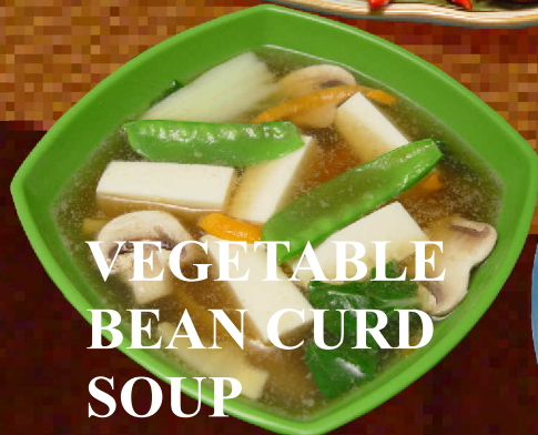
VEGETABLE BEAN CURD SOUP