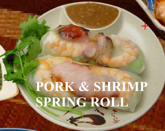
PORK & SHRIMP SPRING ROLL