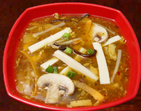
HOT & SOUR SOUP