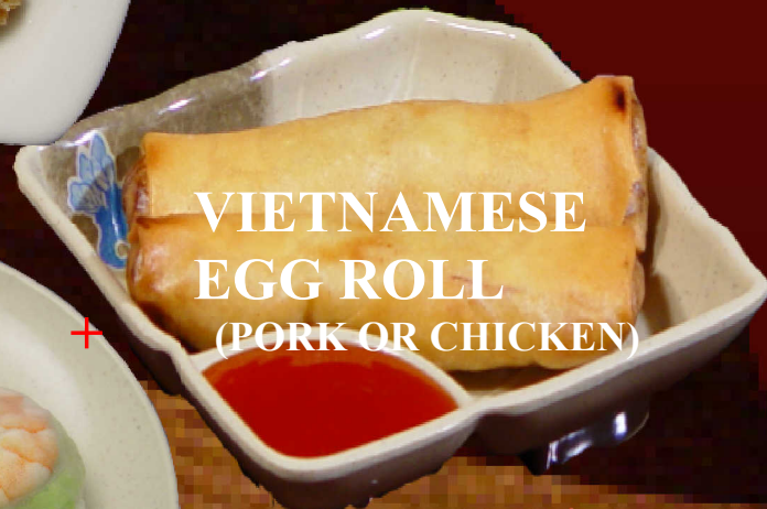
VIETNAMESE EGG ROLL (PORK OR CHICKEN)