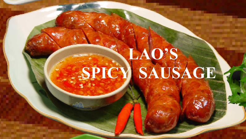
LAO'S SPICY SAUSAGE