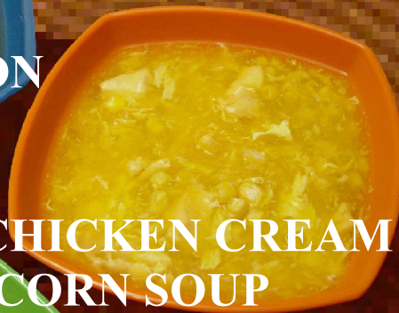
CHICKEN CREAM CORN SOUP